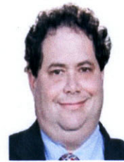
Blake Farenthold District 27 Republican

I'll work with anyone with common sense solutions to problems, but as a conservative, I am unwilling to compromise on my core beliefs that government is too big, taxes are too high and complicated, individuals have rights, and that God and family are the foundations of our society.