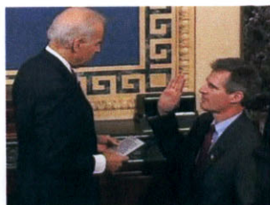
VP Joe Biden swears in Scott Brown.

The similarities to today's times are amazing. Over taxed citizens